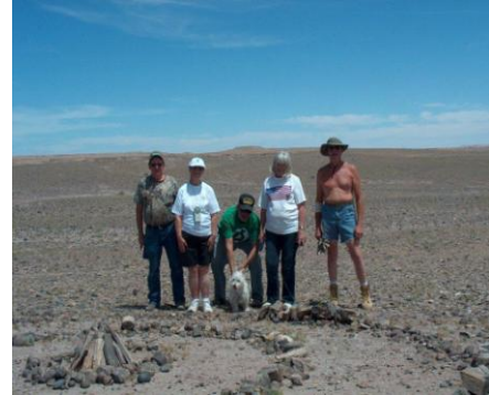
Here we are with the famous 'fire ring'.

However there are pieces of clear, red, orange, and brown agatized wood. As noon approached we took a break and then headed for the Pueblo Ruins inside Sunset Crater Monument. It is a self-guided tour so you can go at whatever pace is agreeable to everyone.